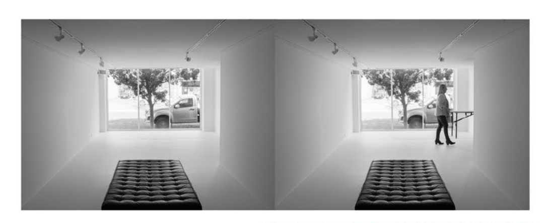
UNDER THE SOUTHERN SUN - SET-UP